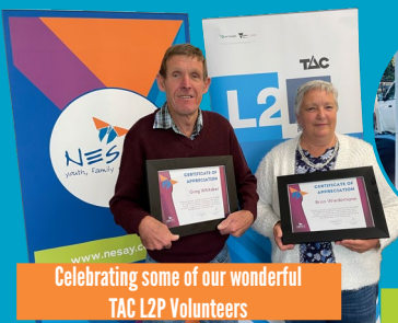
Celebrating some of our wonderful TAC L2P Volunteers

Creating Connections offers support to young people who are at risk of, or who are experiencing homelessness that require multiple support needs and coordination. Intensive and holistic case management support is offered for an extended period and focuses on developing the young person's capabilities by recognising and encouraging their strengths, skills and aspirations. Funding is provided by the Department of Families, Fairness and Housing.