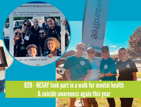
B2B - NESAY took part in a walk for mental health & suicide awareness again this year